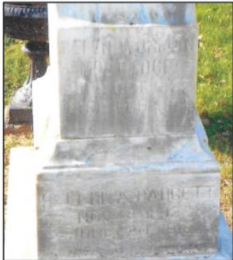
Before and after pictures of the restoration of Helen's headstone.

There is already an agreement established for the care and maintenance of vases with flowers adjacent to the tombstones. It is therefore nice that the Padgett headstones will now also be cared for.